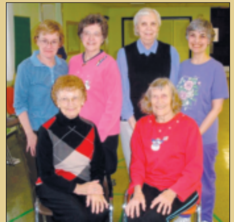
Dance classes keep them forever young—these lovely ladies take a break from their dancing to pose for a photo.