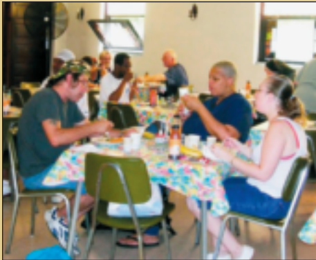
Guests enjoy a mid-day meal at Intersection—for some, it is their only meal that day.

Founded in 1972, Intersection serves individuals and families in McKeesport, Pennsylvania and the surrounding areas who are economically poor, disadvantaged, and in need. Many persons come to Intersection who are unable to find help from any other source. Respect for the dignity of each person is of primary importance.