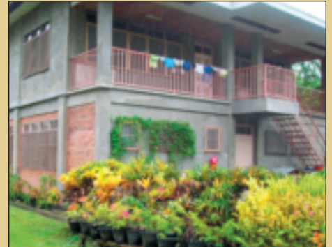
McAuley Center – a safe haven where healing can begin from the ravages of abuse and exploitation.

Our cases are overwhelming with rape and incest as the highest in number.